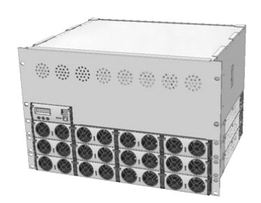
Flatpack2 7U Integrated System