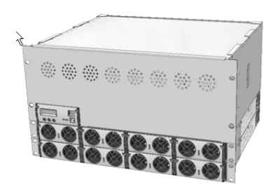
Flatpack2 6U Integrated System